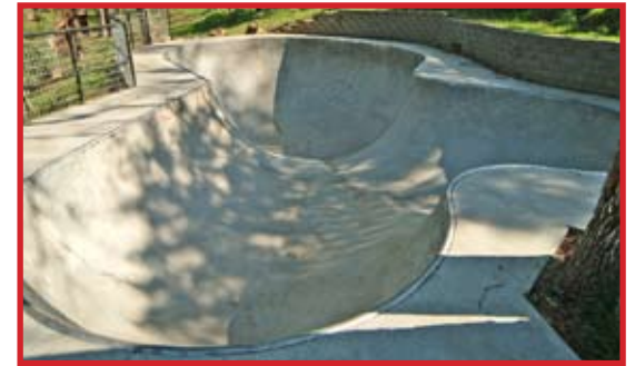
Hood River, OR

Many local skate parks have built skate bowls/pools and other advanced skating areas with great success!